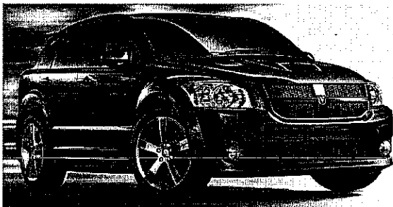
Bristol County Dodge 205 Child St. Warren RI02885

Full Lunch In Crestwood Clubhouse Included 11:30-12:30